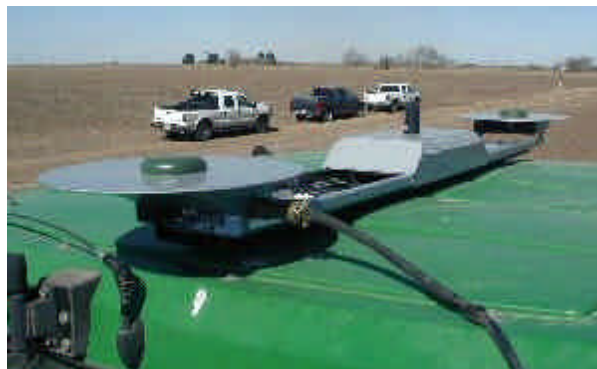
An improved antenna array takes signals from AutoFarm's

For more information contact AutoFarm, a division of Novariant Co., at www.gpsfarm.com , or call (866) 4AUTOFARM.